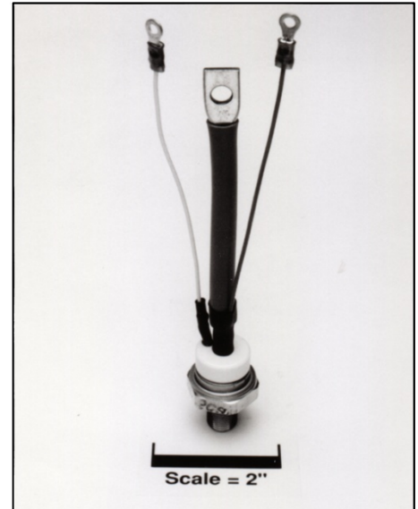
2N4361-2N4371 Phase Control SCR 70 Amperes Average (110 RMS), 1400 Volts