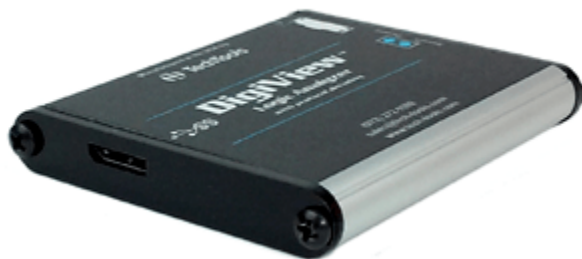
Rear View - DV509:

Channel Cable Connector, Status LED, Power LED