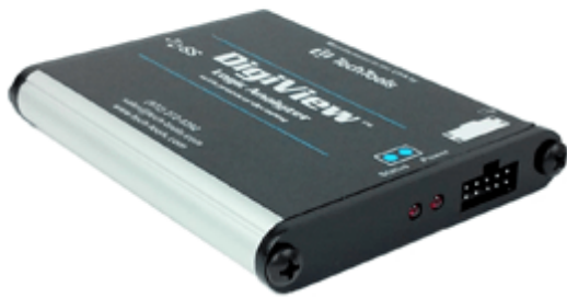
Front View - DV509:

Channel Cable Connector, Status LED, Power LED