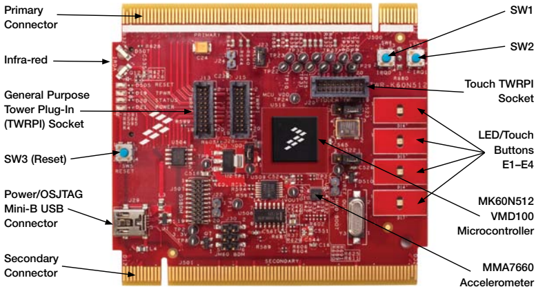
Figure 1: Front Side of TWR-K60N512 Module Not Including TWRPI.