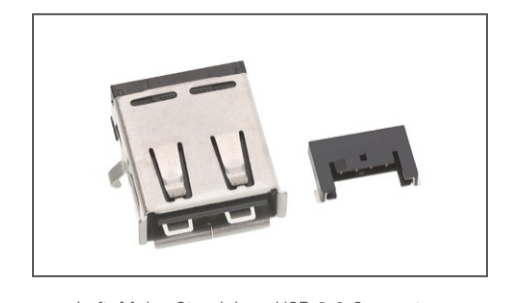
Left: Molex Standalone USB 2.0 Connector; Right: Pico-Lock USB 2.0 Connector Used in Molex USB Hub