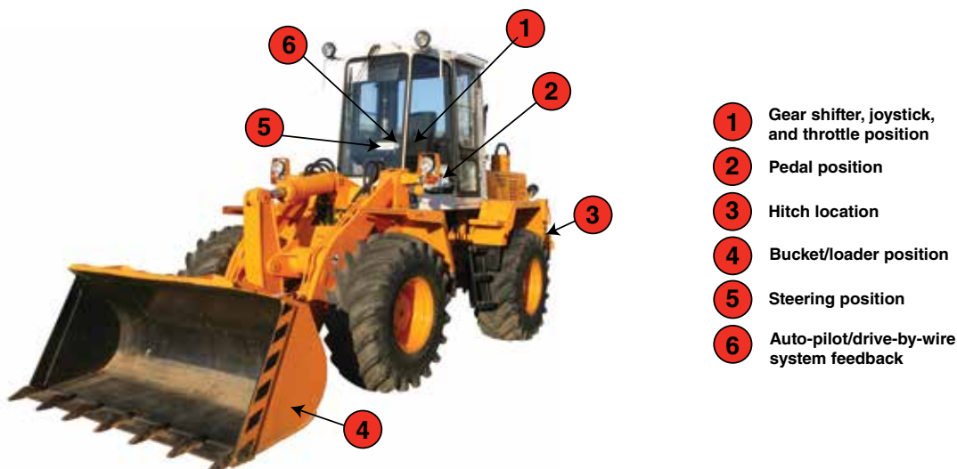
Figure 1. Potential HRS Series Transportation applications shown on a front loader

Customer benefit: May eliminate the mechanical cable, which can stretch and rust, can improve engine control system response that benefits the vehicle's emission, as well as improve reliability, and reduce excess weight in the vehicle. This type of drive-by-wire system can be safer and less expensive than cable-connected systems. Also provides more speed control when the pedal is pushed down.