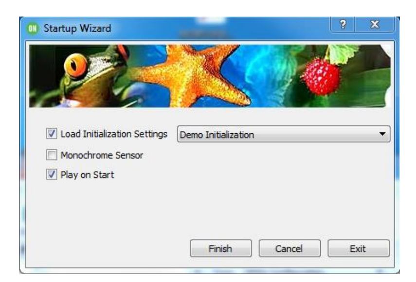
Figure 2: Startup Dialog

2. After the software has found an attached device, the DevWareX window will appear with the dialog box shown in Figure 2 on page 3; select the settings shown. (Color/monochrome sensors will also need to have the color or monochrome box checked, as appropriate.) Click "Finish."