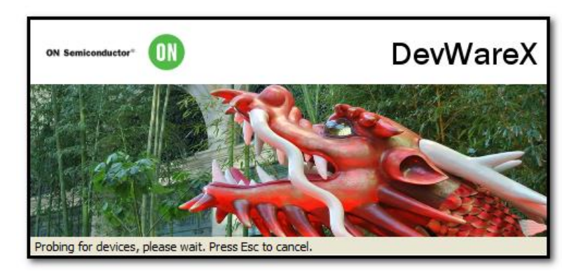
Figure 1: DevWareX Popup – Searching for Attached Devices

2. After the software has found an attached device, the DevWareX window will appear with the dialog box shown in Figure 2 on page 3; select the settings shown. (Color/monochrome sensors will also need to have the color or monochrome box checked, as appropriate.) Click "Finish."