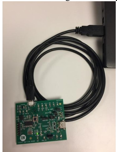
Figure 1 - EVB connected to PC