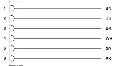
Contact assignment of the DEUTSCH DT06-6S