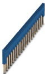
Plug-in bridge, pitch: 4.2 mm, number of positions: 20, color: blue

Please be informed that the data shown in this PDF Document is generated from our Online Catalog. Please find the complete data in the user's documentation. Our General Terms of Use for Downloads are valid ( http://phoenixcontact.com/download )