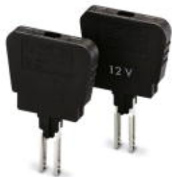
Fuse plug, nominal current: 6.3 A, length: 33.1 mm, width: 6.1 mm, height: 45.7 mm, color: black

Please be informed that the data shown in this PDF Document is generated from our Online Catalog. Please find the complete data in the user's documentation. Our General Terms of Use for Downloads are valid ( http://phoenixcontact.com/download )