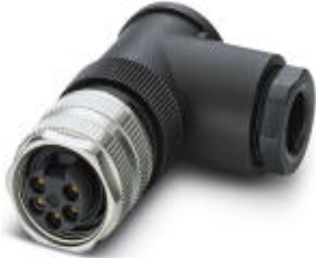
Sensor/actuator connector, female, angled, 5-pos., 7-8", screw connection, metal knurl, cable gland Pg13

Please be informed that the data shown in this PDF Document is generated from our Online Catalog. Please find the complete data in the user's documentation. Our General Terms of Use for Downloads are valid ( http://download.phoenixcontact.com )